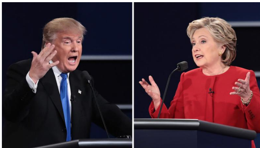
Republican nominee Donald Trump (left) and Democratic nominee Hillary Clinton (right) during Monday's presidential debate

It's important for all Stony Brook student clubs and individual students interested in hosting any political activity on campus to contact the Office of Student Affairs to ensure that all are in compliance with both state and federal rules and regulations.