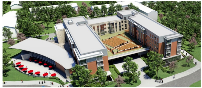
Toll Drive Residence Hall is the University's latest campus project to address the housing shortage.

In an effort to address our future housing needs, University officials posted a formal Request for Qualifications with the state to create a public-private housing development - which would be the first of its kind on the 25,000-student campus. The "campus village" would be targeted to students and young faculty, and would create a safe, affordable alternative to traditional off-campus housing.